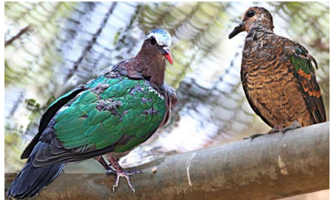
New born Emerald Dove at Dhaka Zoo.

In Bangladesh there are 17 species of Columbidae, of which 2 are migratory. Emerald Dove ( Chalcophaps indica ) is one of the resident species among them 4 . According to Bangladesh Red List the status of marine and migratory vertebrates 1 in Bangladesh is: 240 species, 2 - EN, 04 - VU, 6 - LR, 4 are DD and 224 are not threatened 3 . A study by Anisuzzaman, 2000 indicated that Emerald Doves are not threatened in Bangladesh at present.